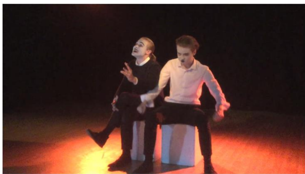
EDUQAS A-Level Reinterpretation. "Two" in the style of Berkoff. (Dress rehearsal.)