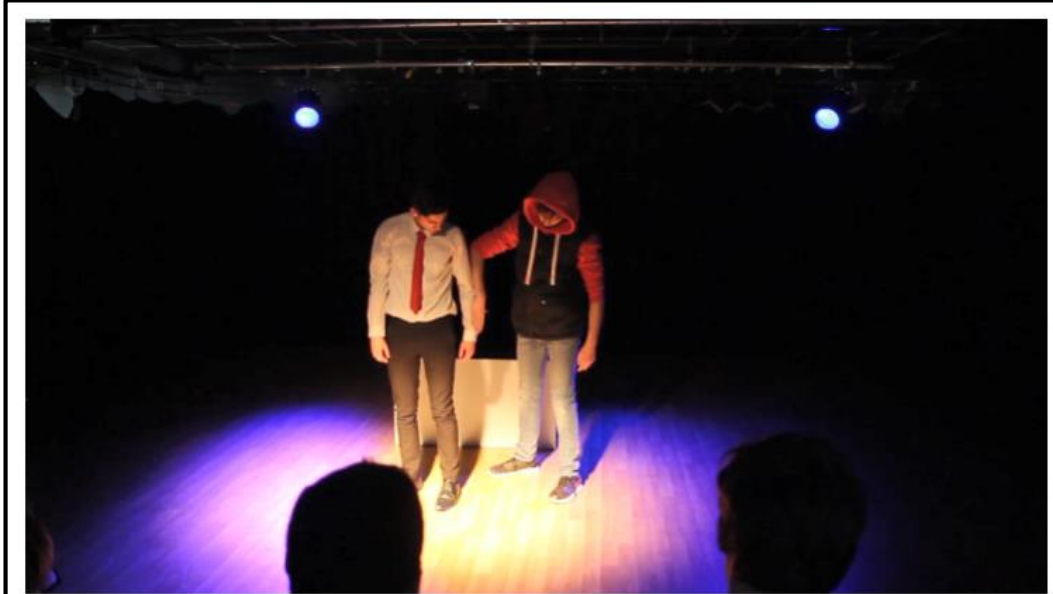
Tiny Dynamite by Abi Morgan. AS Level Drama and Theatre Studies