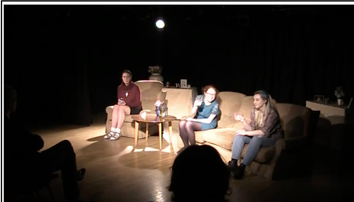
Stanislavski - The Cooley Girls EDUQAS A-LEVEL '18